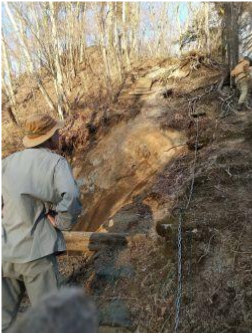
Collapse Site 1