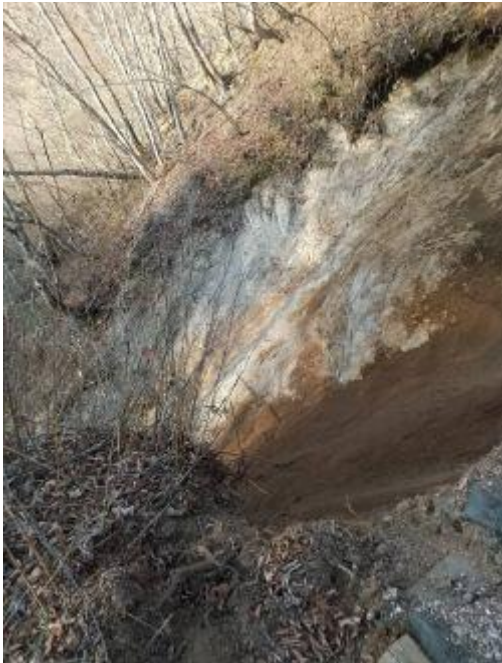
Collapse Site 3