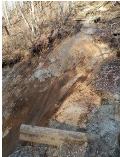
Collapse Site 2